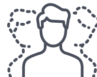
Feelings of losing control