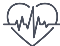
Heart palpitations, rapid or pounding heart rate