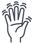
Trembling or shaking