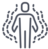
Numbness or tingling