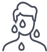
Chills, sweating, or hot flashes