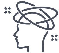
Feeling lightheaded or "dizzy"